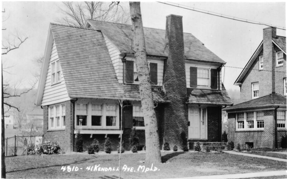
BOARD OF REALTORS of the ORANGES & MAPLEWOOD